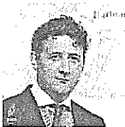
Rathfarnham comhaontas glas