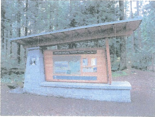
Example Pic 3 ; Information stand